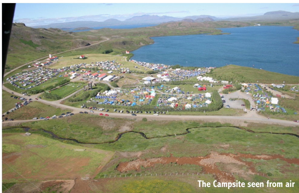
The Campsite seen from air

Tel: +354-550 9800 Fax: +354-550 9801 www.roverway.is roverway@scout.is