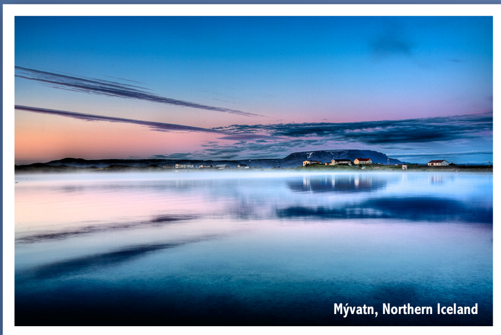
Mývatn, Northern Iceland