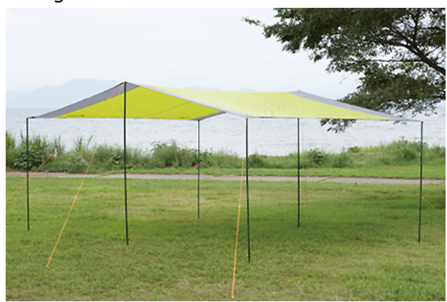
W5,000 mm×D3,600 mm×H2,300 mm