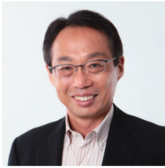
Former Head Coach, Japan National Football Team / Current Owner of FC Imabari Takeshi Okada

TA-Q-BIN DOOR-TO-DOOR PARCEL DELIVERY SERVICE